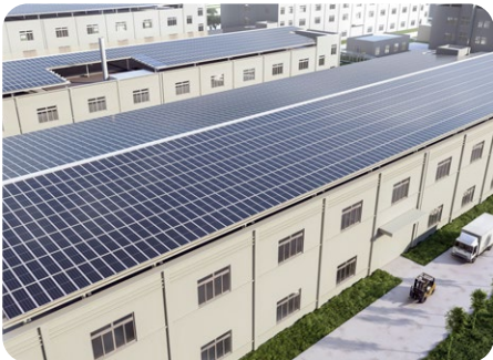
Flat-to-pitched Roof Conversion