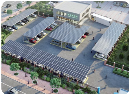
PV Charging Carport With Storage